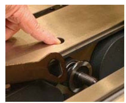
Blade changing on the ProShop saw requires the included blade wrench and a single finger to depress the arbor lock.

While bringing the motor inside of the cabinet, we moved the sometimes difficult to reach bevel stop adjusters to the outside. Making these adjustments is now a matter of inserting the included 4mm hex wrench into sockets in the table surface to fine-tune the 0-degree and 45-degree blade tilt stops.